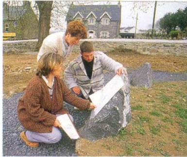
1998 Special Merit Award: Implementing quick local Community plan in Kilkenny, Ireland.

The ECTP organised three series of the European Urban and Regional Planning Awards with the financial support of the European Commission (DG XVI) in 1990, 1994 and 1998.