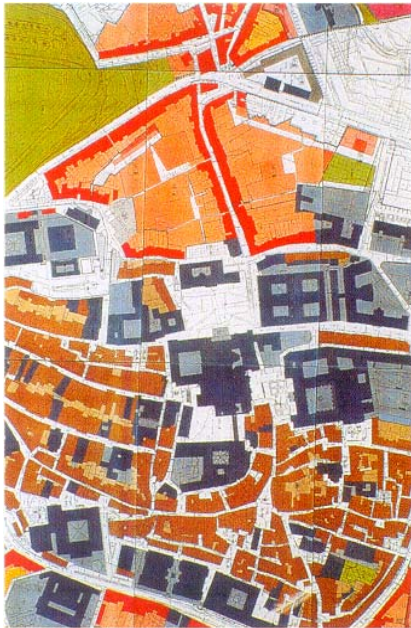
1998 First Prize for Local Planning: Special Plan for the historical town centre of Santiago de Compostela, Spain.

The ECTP organised three series of the European Urban and Regional Planning Awards with the financial support of the European Commission (DG XVI) in 1990, 1994 and 1998.